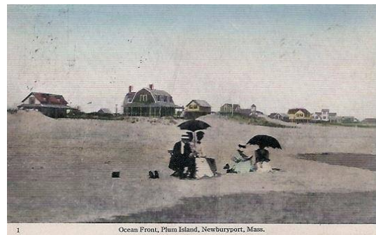
1 Ocean Front, Plum Island, Newburyport, Mass.

Once remote places, the beaches have evolved and changed. The presentation will describe the dramatic events that have altered the coastline and effected the communities: erosion from severe storms, devastating fires, and shipwrecks.